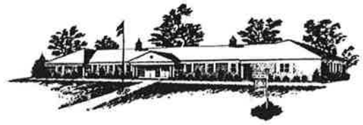
James R. Ryan Municipal Building

5635 S. New Berlin Road Hales Corners, WI 53130 Phone: (414) 529-6161 Fax: (414) 529-6179 www.halescorners.org